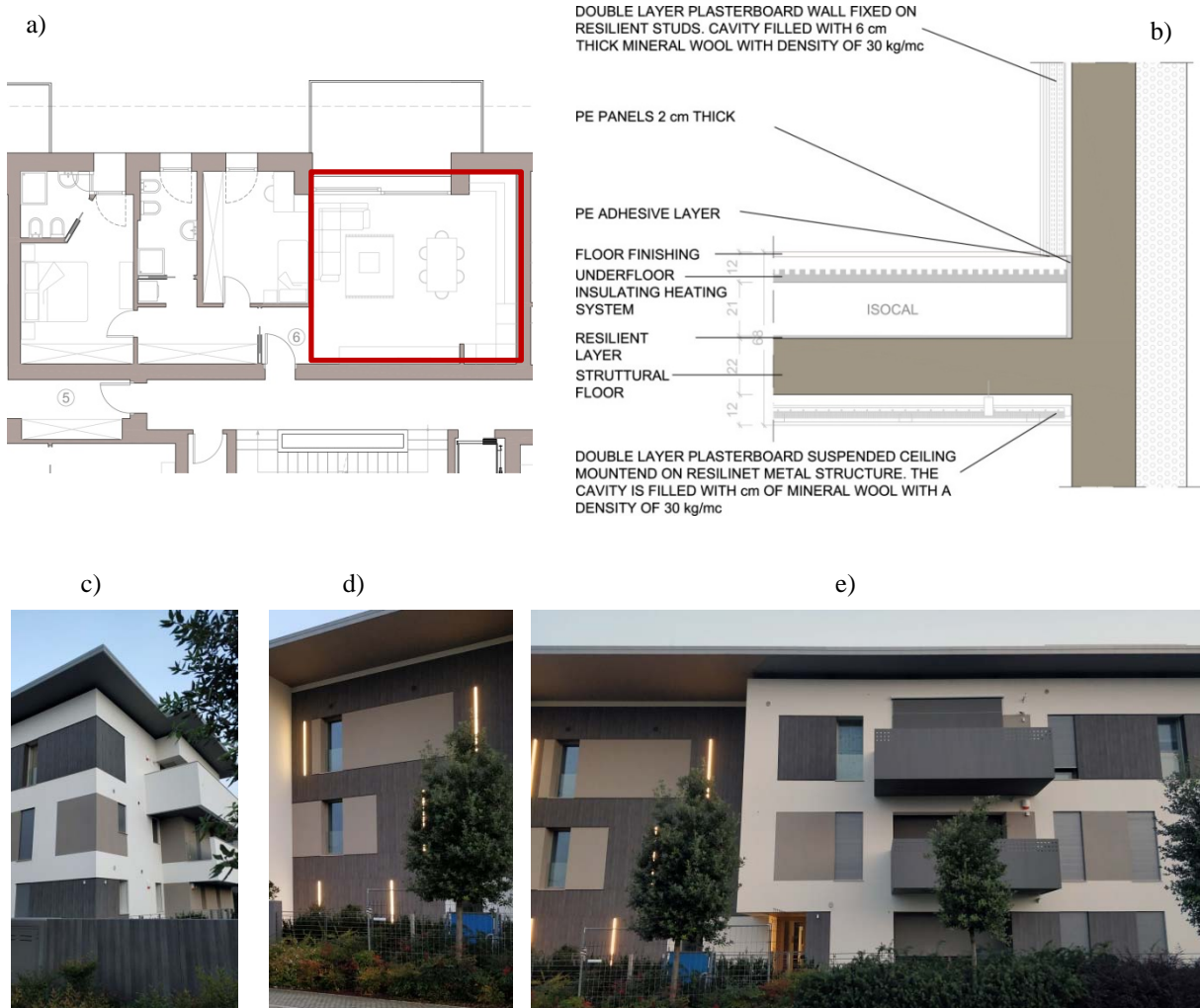
Figure 1: a) plan view of the apartment (in red the receiving room); b) measured floor; c), d), e) photos of the building.